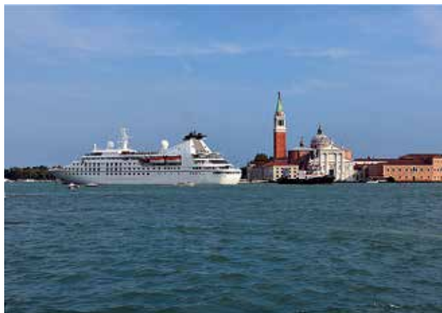
The Doges and the Venetian citizens were used to seeing big ships pass from the port to the sea and back, but what would they have thought of this big cruise ship passing. Let alone the other 3 that were moored in the docks further to the right and out of sight.