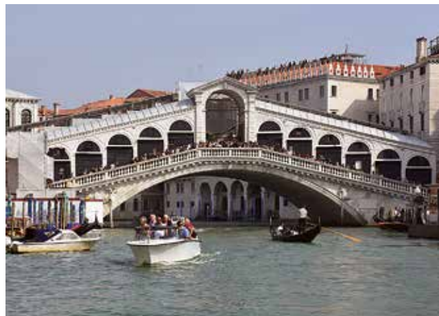
A view of the famous Rialto Bridge, the oldest and most picturesque of the many bridges that cross the Grand Canal.