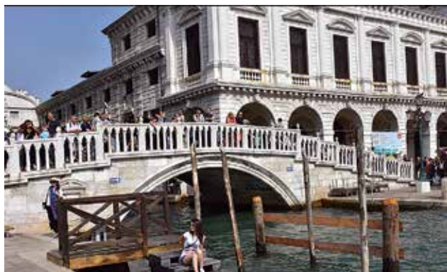
The Paglia bridge crosses the small canal that separates the prison from the Doge's Palace.