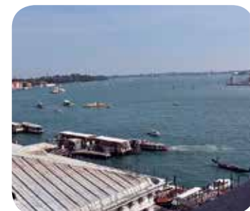
Below: The Doge's view to the Basin and the sea beyond.