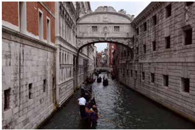
A photo taken from the Paglia Bridge shows the Bridge of Sighs that crosses the small canal that runs between the palace and the prison. The Palace housed the law court where the Doge heard cases and dispensed "justice." When the verdict was prison, prisoners would cross the bridge of sighs from the Palace to the Prison.