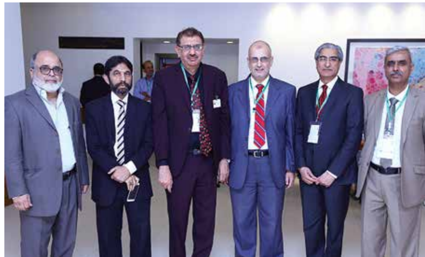
Some of the Delegates, Karachi, 7&8 April 2017.