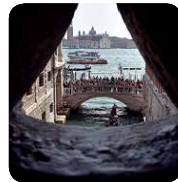
The view through one of the stone 'windows' on the Bridge of Sighs looking to the Paglia Bridge, St. George's Church and the Basin. This would have been the last view of the outside world that the convicted prisoners would have had before they entered the prison cells.

In Padova there was a much less restricted environment than existed outside the Doges' jurisdiction. The attractions for staff were that they were well paid, they were not restricted in what investigations they could do and they had freedom of speech.