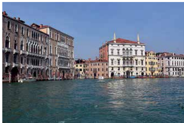
The Grand Canal is a busy waterway that is lined by palaces built by the wealthy merchants. They demonstrate a variety of architectural styles.