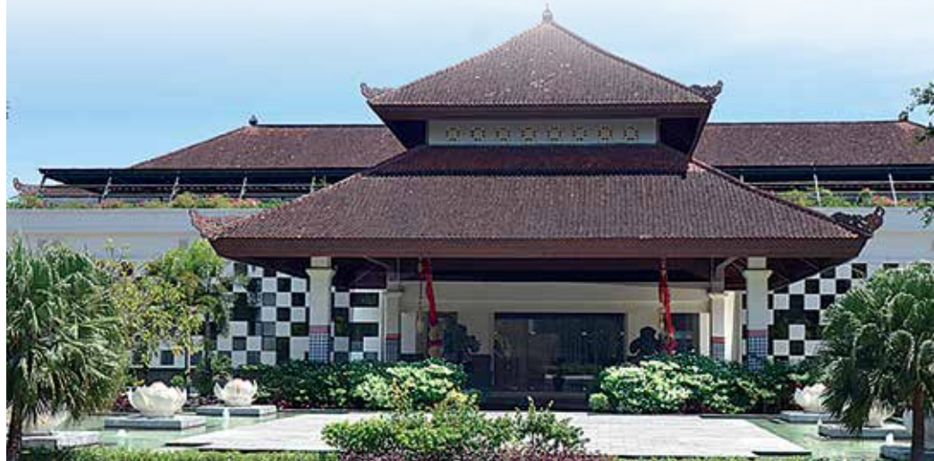
Entrance to the Nusa dua Hotel