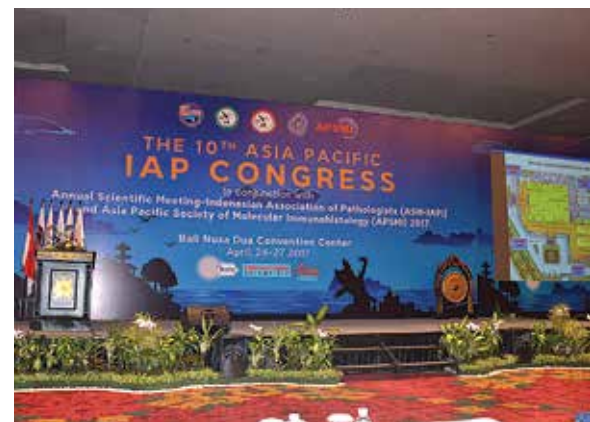
Opening ceremony, Stage and banner. Striking the gong to announce the Opening of the Congress.

The faculty included 143 internationally renowned speakers who addressed the most recent issues and controversies in their fields of interest. The Congress was attended by 720 participants from 42 countries.