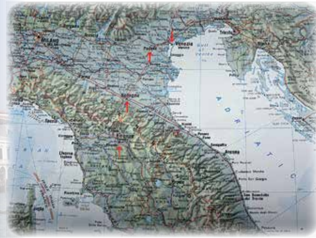
Map of Northern Italy with the cities of the Renaissance marked. Note the natural barrier that resulted in the formation of a protected lagoon for Venice.

The Doge's Palace. The top floor was the living quarters for the Doge. From the balcony in the middle the Doge could watch his merchant ships leaving in the Spring for their trading voyages, and returning in Autumn laden with goods for sale. The full tide is lapping at the edge of the walking areas.