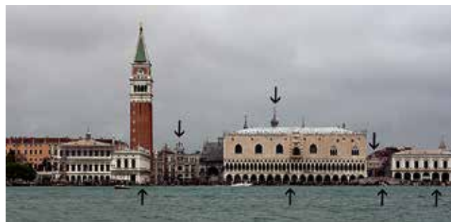
A view of St. Marc's square from a water taxi in the Basin. The landmarks are labelled from right to left. The prisons, joined to the Ducal (Doge's) pink marble Palace by the 'bridge of sighs.' St Marc's Church is behind the Palace. A clock tower was designed for St Marc's square so that this view of the Square would blend harmoniously with the adjacent buildings - the library and the archaeological museum on the water front, and the tall Bell tower behind it.

In the late 1400s the Doges must have decided to develop the University of Padova further, so they instructed their merchants to recruit staff for it.