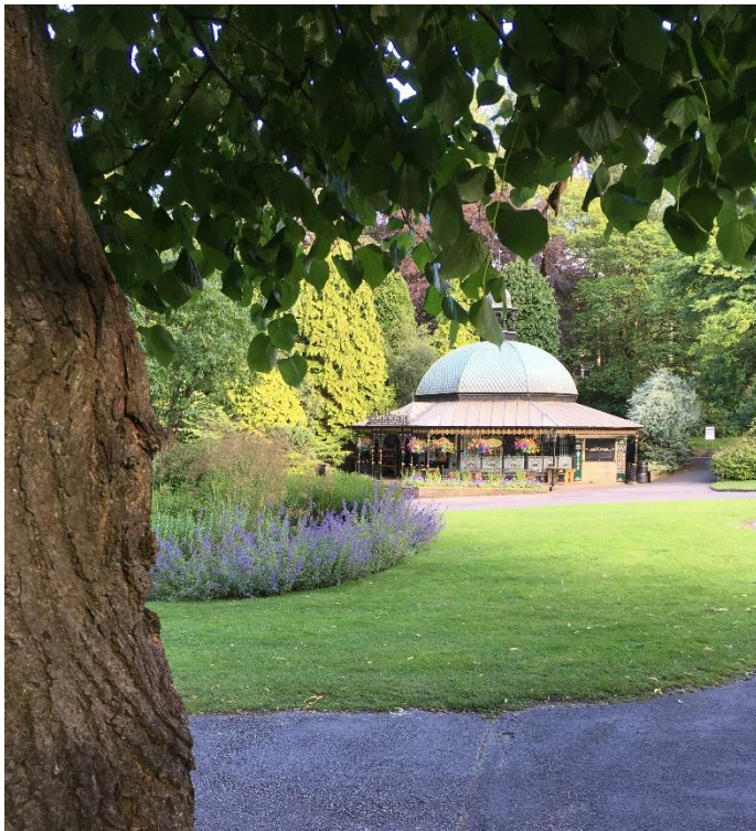
The park where the welcome reception was held