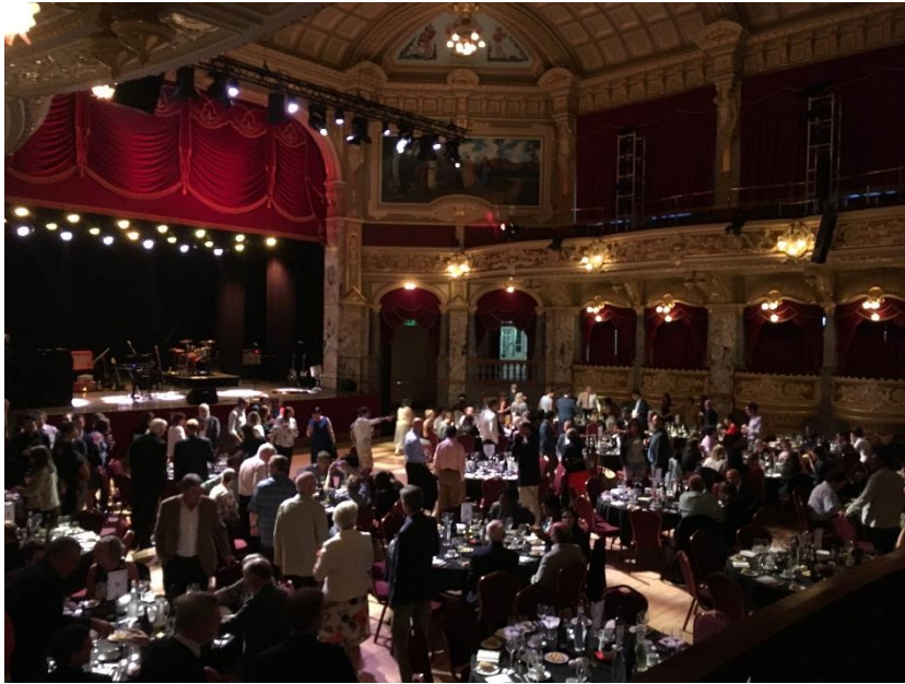
The conference dinner at the Royal Hall