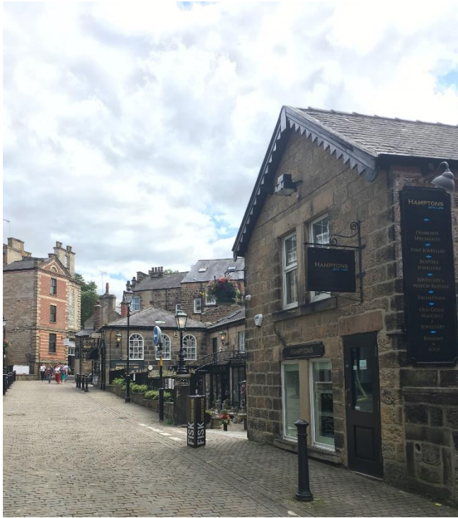
A nice day in Harrogate