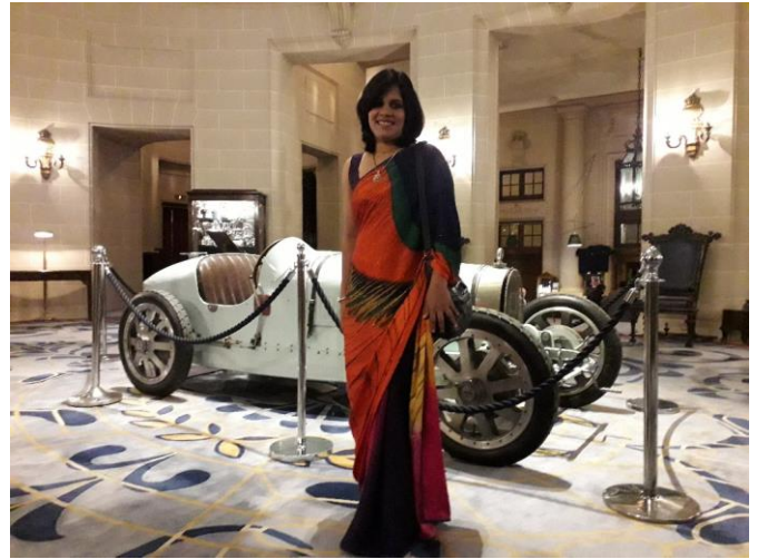
At the symposium dinner