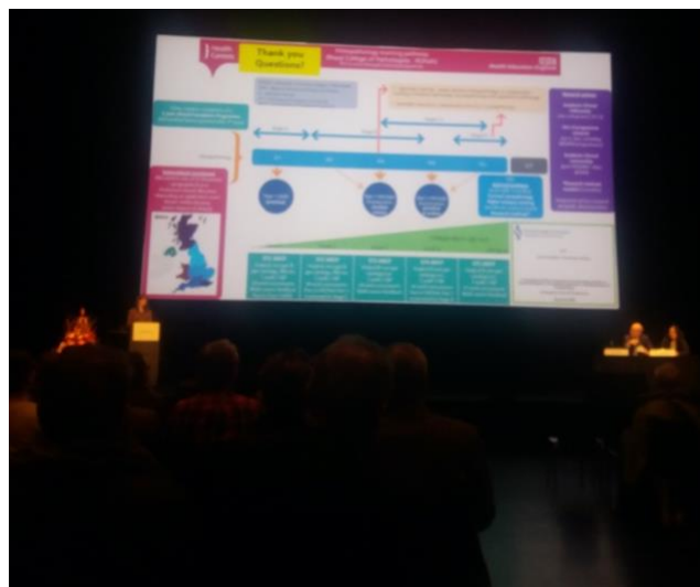
My closing summary slide

The content tied in very well with the findings of my project, and I received offers of collaboration to extend my work which I intend to take up.