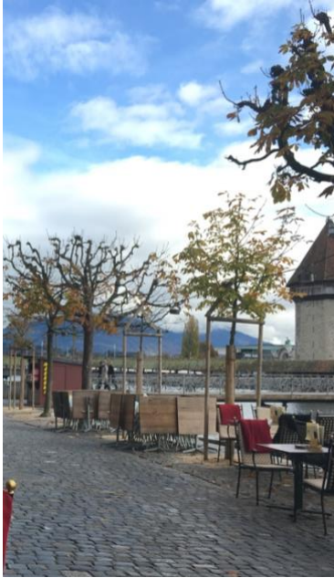
Mountain views from the streets

The meeting is run in a different city each year, and Lucerne was the venue for the 2019 event. Outside of the sessions, events were put on to allow delegates to socialise and enjoy the city. These included evening snacks and drinks after the sessions finished for the day, a “Pathology run” along the shores of Lake Lucerne (which I was not feeling athletic enough to attend but enjoyed hearing about!), a tour of the KKL concert hall attached to the conference venue, and of course the conference dinner.