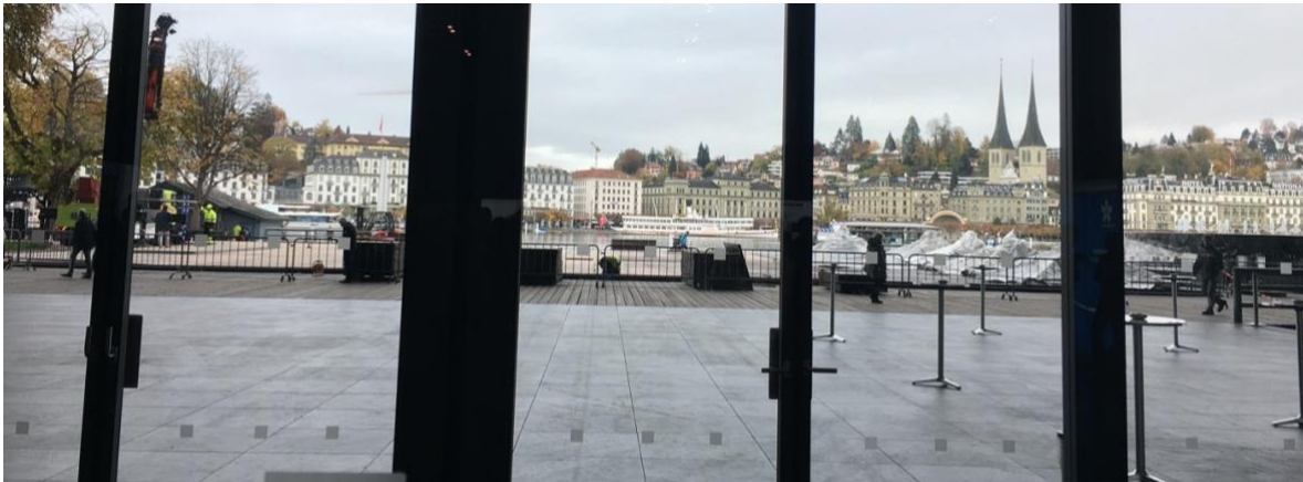
Lakeside views from the conference hall

Thank you very much again to the BDIAP for the travel bursary. This covered my conference registration fee as well as up to £500 for other incurred expenses and was extremely easy to apply for.